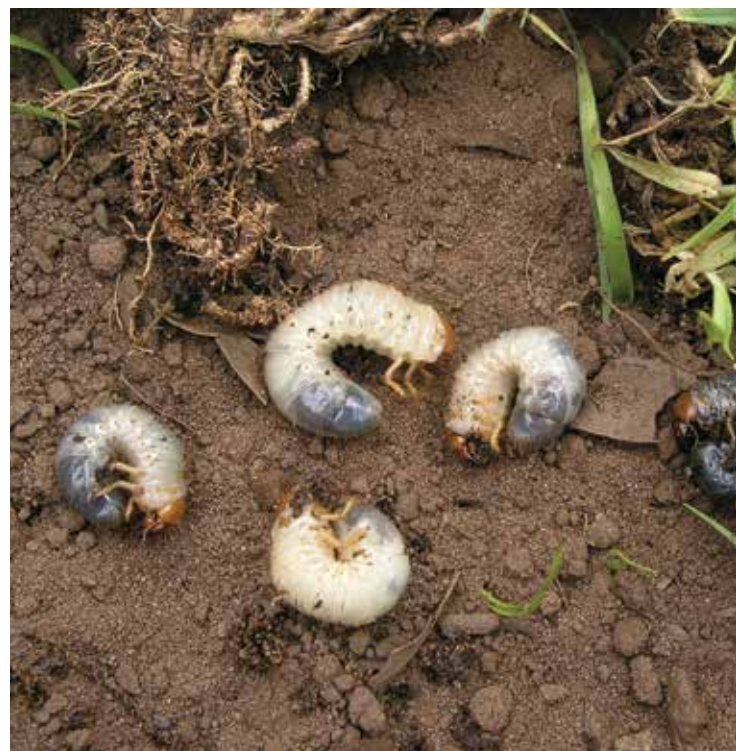
High density scarab larvae populations found beneath damaged turf.